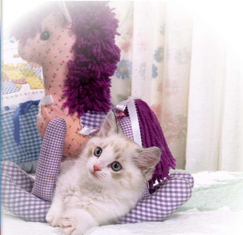
Sire: Pizzicato Pizzazz of Encore Dam: My Minuet of Encore

Puck, as he was called, was the first RagaMuffin ever shown in competition. Barely 4 months old he took Best Kitten in Show in UFO's first show in Bradenton, FL.